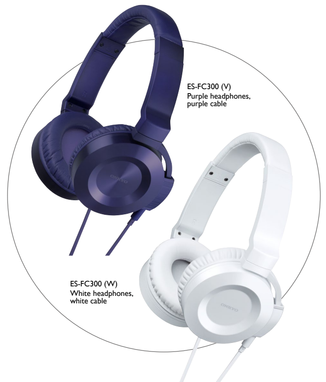
ES-FC300 (V) Purple headphones, purple cable